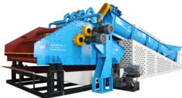
Spiral sand washing and recycling machine