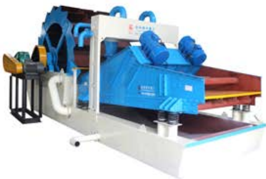
LZ sand washing & recycling machine