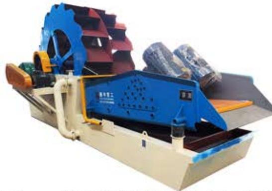
XS sand washing & dewatering machine