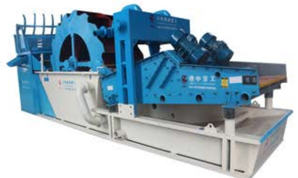
Trommel type sand washer